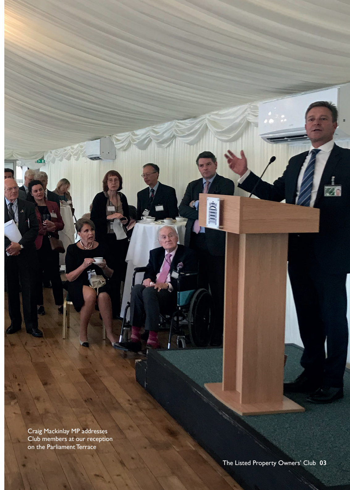
Craig Mackinlay MP addresses Club members at our reception on the Parliament Terrace