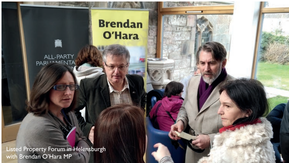
Listed Property Forum in Helensburgh with Brendan O'Hara MP

The APPG will continue to be a voice for the concerns of listed property owners. Its members will be working alongside the Club, our members and the wider heritage community to raise issues with HM Revenue and Customs; the Department for Digital, Culture, Media and Sport; and the Ministry of Housing, Communities and Local Government. We look forward to seeing more parliamentary questions put to ministers, and to see their responses.